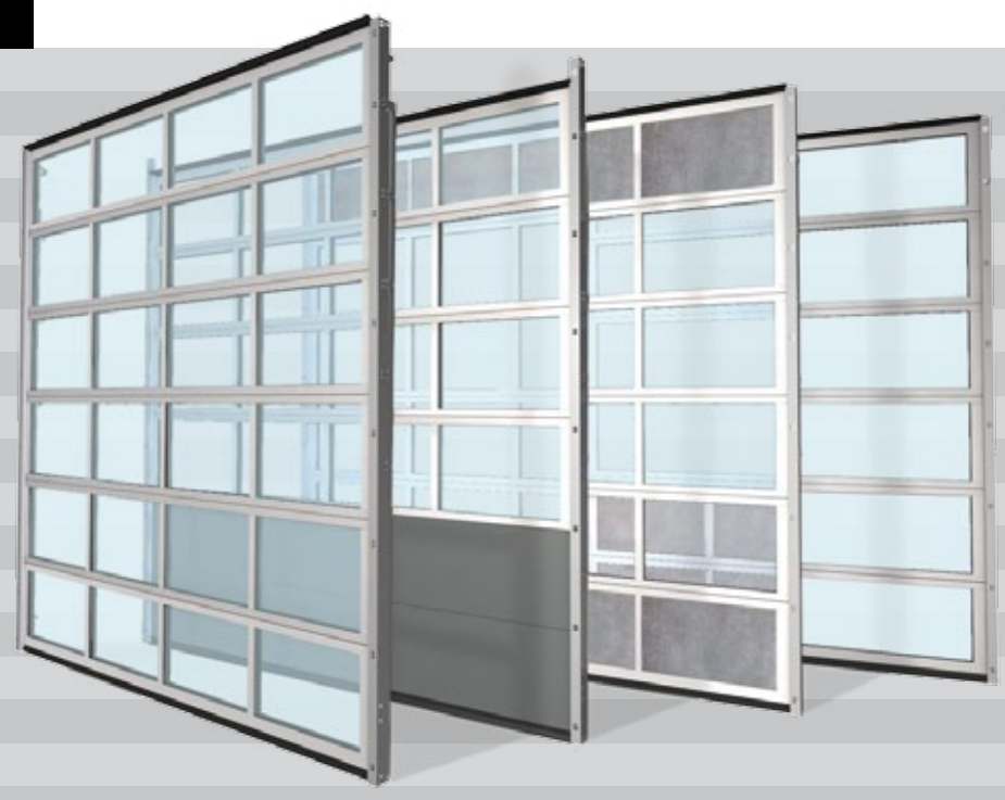
U-value ALU 60 mm sectional door: 5,000 x 5,000 mm: 2.33 W/m<sup>2</sup>K, with triple glazing

visibility and a constant indoor climate are essential.